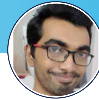
Anup IBPS PO