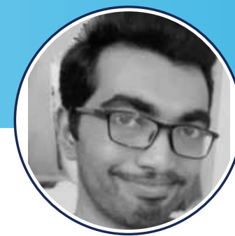
Anup IBPS PO