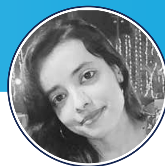
Payal IBPS PO